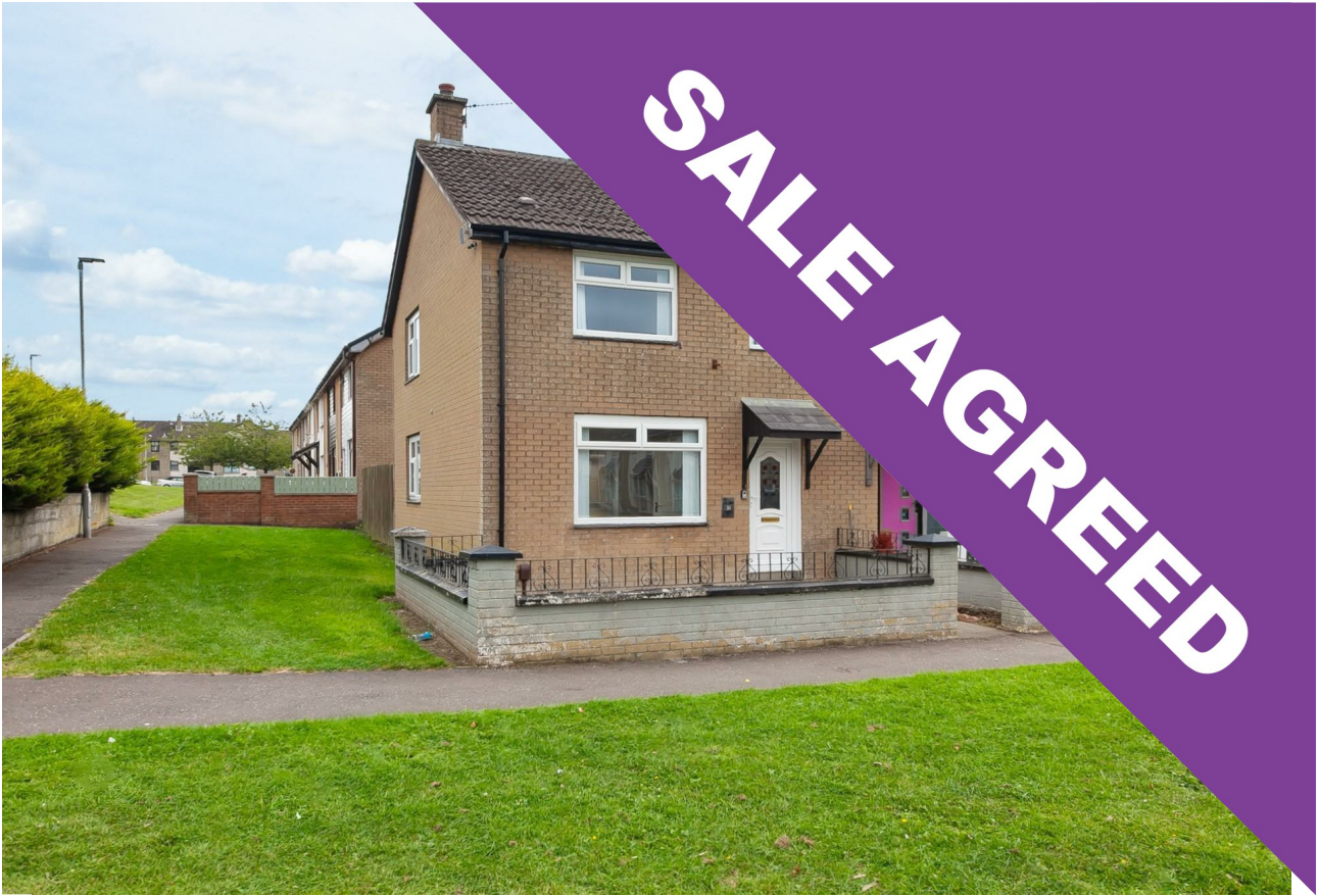
31 Downpatrick Green, Newtownabbey, BT37 0JG